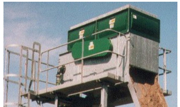
Model 1200 Separator