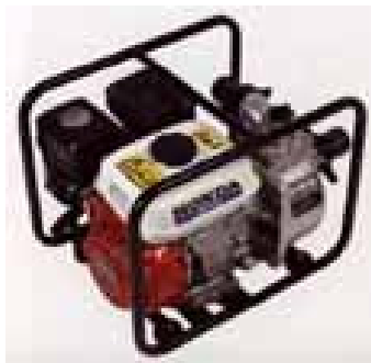
Petrol Engine Driven Pump Unit

The Groundhog range of dirty water pump units come in various sizes to suit the specific requirement of the customer. The range includes electric pumps, engine driven pumps, in petrol or diesel format or P.T.O driven pumps. Each pump unit is carefully selected to give the right flow rate and static head capability for the task in question.