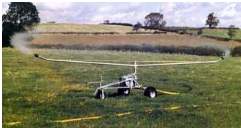
RotorRainer Self Powered Mobile Sprinkler Unit