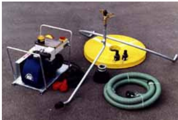
A Typical Low Volume, Solid Free, Dirty Water Distribution Package

The GROUNDHOG range of dirty water distribution units are modular built to the customer's specific needs and circumstances.