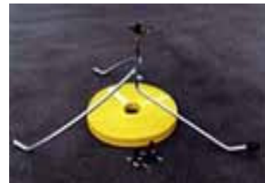
Static Sprinkler Unit

Groundhog sprinkler units come in both static and mobile formats with a range of nozzle sizes to suit various applications.